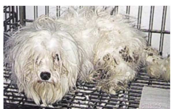
The parents of the puppies in the pet stores look like Hartley.