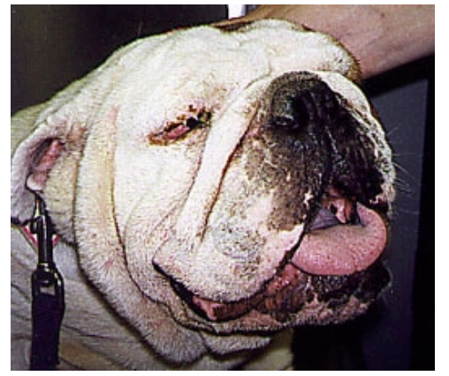
This bulldog was blind from an untreated eye condition.