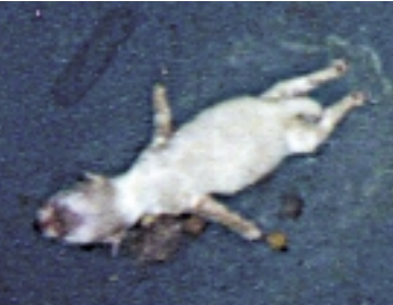
This dead puppy was going to be dumped in the trash.