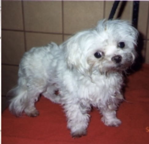
Bari's head is always cocked from neurological damage.