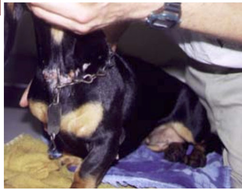
The chain had grown into Justice's neck. It took 4 hours of surgery and 72 stitches to remove the chain.