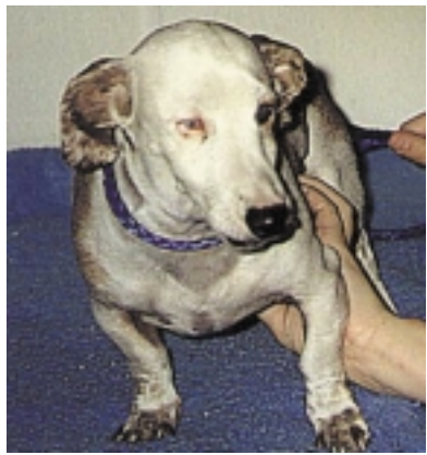
Ace is blind because of a genetic defect. He was a breeder dog in a mill in Texas.