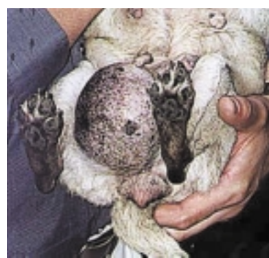
The hernia in the pug was as large as a grapefruit.